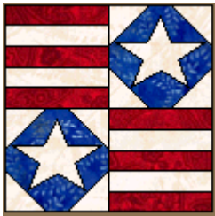
Brochure made 3/05/06